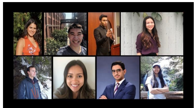
UBC Smart City – first place winners at the 2021 National ASCE Blue Sky Innovation Contest!